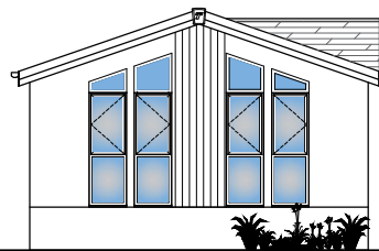
END ELEVATION (LOUNGE)