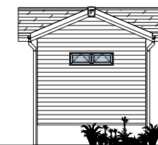
END ELEVATION (BEDROOM)