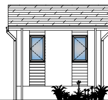
END ELEVATION (LOUNGE)