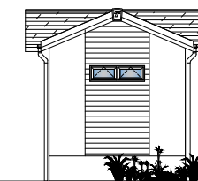
END ELEVATION (BEDROOM)